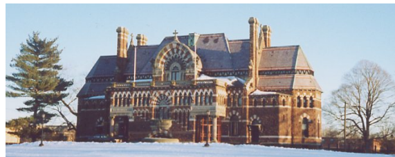
Colt Memorial Parish House-Home of Pax Educare

PAX EDUCARE The Connecticut Center for Peace Education 155 Wyllys Street Caldwell Colt Memorial Parish House Hartford, CT 06106 860-930-3182 www.paxeducare.org